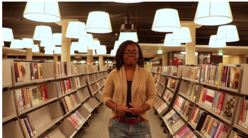
Screenshot from Songs from Home

a video project titled Songs from Home , that involves a few women singing in various spots in Rotterdam and its suburb in their mother tongues.